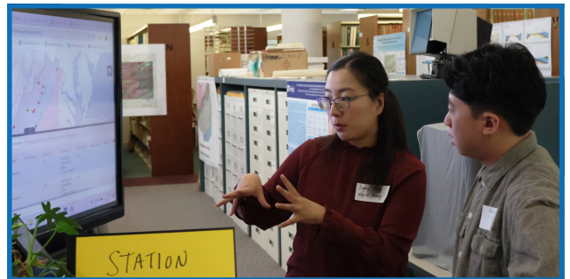
Virginia Energy experts combine technology and education, providing hands-on learning opportunities with our geological mapping databases.