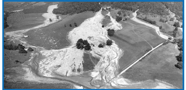
Virginia Energy uses innovative technology like LIDAR to help residents identify areas that could become geologic hazards.

Virginia Energy reduced regulatory burdens by over 26%, meeting the Governor's target and saving Virginians more than $1.2 billion annually. From permitting and energy programs to mining and geology, we're making it faster, clearer, and more cost-effective to access the services Virginians rely on.